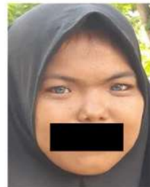
Figure 10 The facial features of index finger's nephew which presence with bright blue iris on both eyes (case 10).