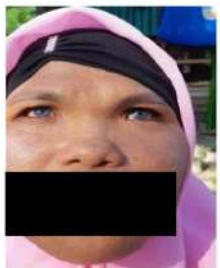
Figure 2 Facial features of the index subject's daughter (case 2).