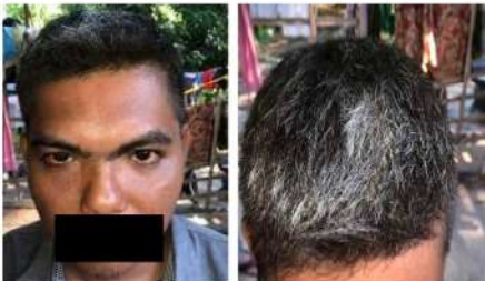
Figure 7 The facial features of index finger's nephew which presence with minor criteria (case 7).