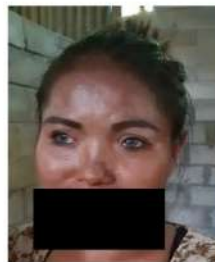
Figure 4 Facial features of the younger siblings with major criteria (case 4).